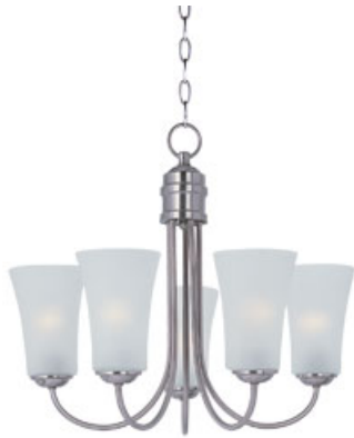
10045FTSN Logan 5-Light Chandelier