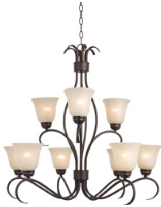
10128WSOI Basix 9-Light Chandelier