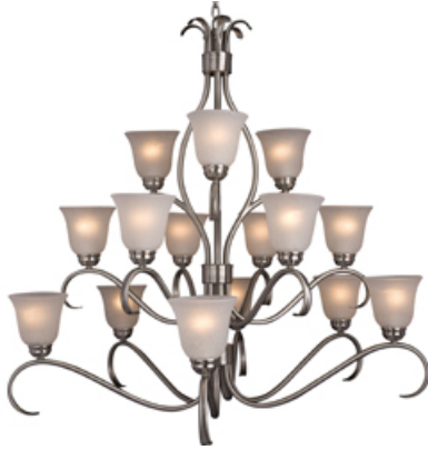
10129ICSN Basix 15-Light Chandelier