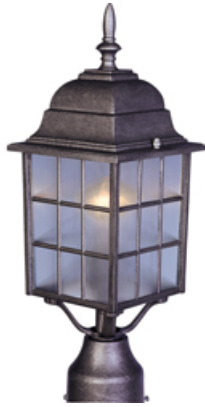
1052PE North Church 1-Light Outdoor Pole/Post Lantern