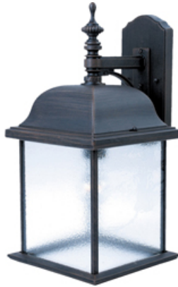
1057RP Senator 1-Light Outdoor Wall Lantern