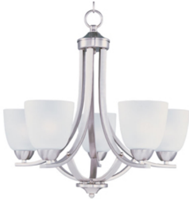
11225FTSN Axis 5-Light Chandelier