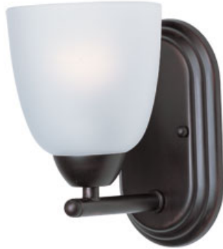
11311FTOI Axis 1-Light Wall Sconce