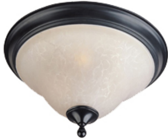
11799ICBK Linda 2-Light Flush Mount