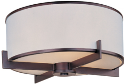
12050WTOI Nexus 3-Light Flush Mount