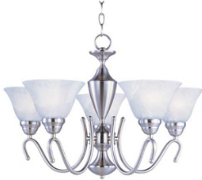
12063MRSN Newport 5-Light Chandelier