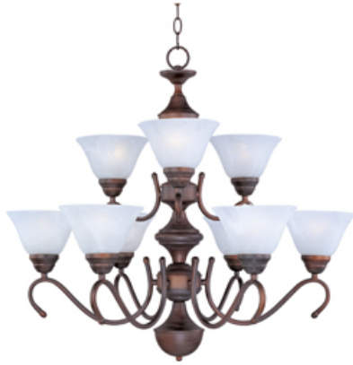
12065MROI Newport 9-Light Chandelier