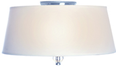
12751WTPN Rondo 3-Light Flush Mount