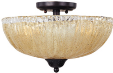
13410AIOI Barcelona 3-Light Semi-Flush Mount