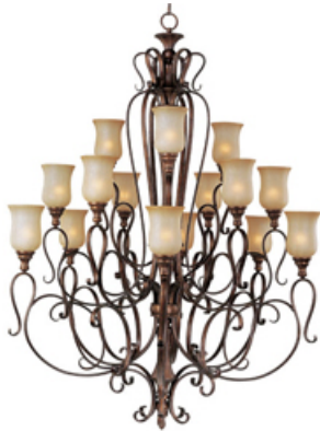
21127MCFL Sausalito 15-Light Chandelier