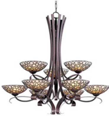
21346DWUB Meridian 9-Light Chandelier