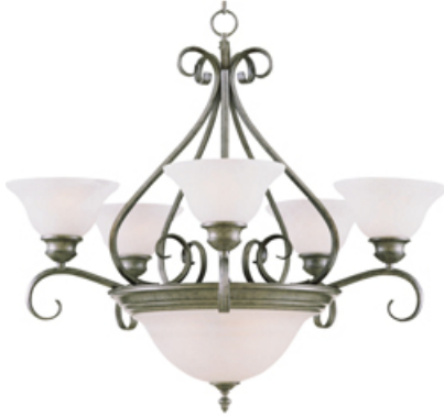
2656MRPE Pacific 7-Light Chandelier