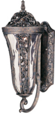
40143WGTR Montecito VX 2-Light Outdoor Wall Lantern