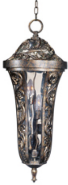
40147WGTR Montecito VX 4-Light Outdoor Hanging Lantern