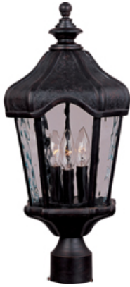
40270WGOB Garden VX 3-Light Outdoor Pole/Post Lantern