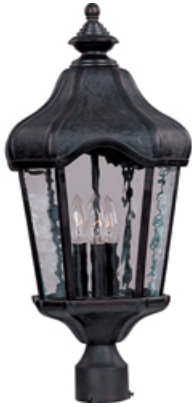
40271WGOB Garden VX 3-Light Outdoor Pole/Post Lantern