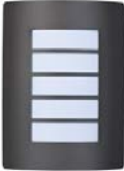
54321WTBZ View EE 1-Light Wall Sconce