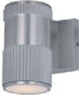
6122AL Lightray 1-Light Wall Sconce