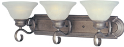
8023MRPE Pacific 3-Light Bath Vanity