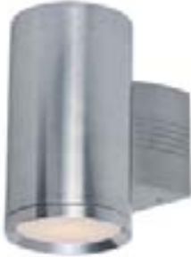
86101AL Lightray 1-Light LED Wall Sconce