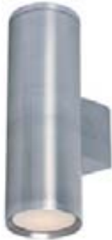
86102AL Lightray 2-Light LED Wall Sconce