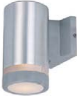
86110AL Lightray 1-Light LED Wall Sconce