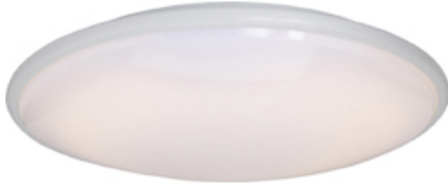
87211WT Rim EE 2-Light Flush Mount