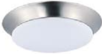
87597WTSN Profile EE LED Flush Mount