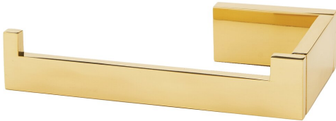
A6466L-PB RIGHT HAND SINGLE POST TISSUE OR TOWEL HOLDER