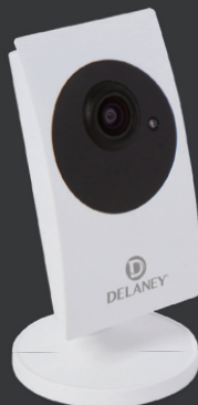
Video Camera Z-Wave Bridge Gateway (Item #ZW100)