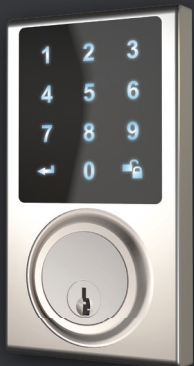
ZWAVE Touchscreen Deadbolt (Item #ZW300)