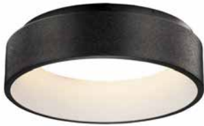
E31252-BBK Flush Mount