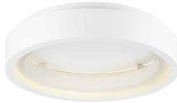
E35001-MW Flush Mount