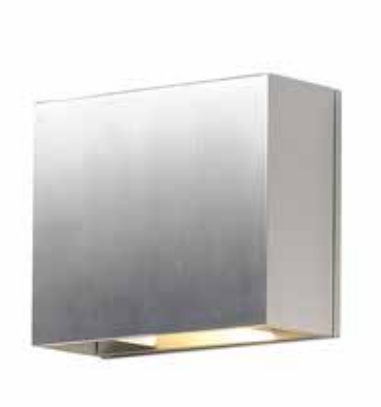
E41328 *ADA Version