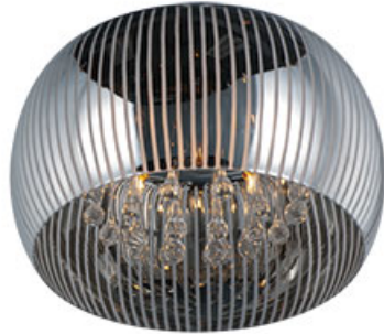
E21401-81PC Sense II 5-Light Flush Mount