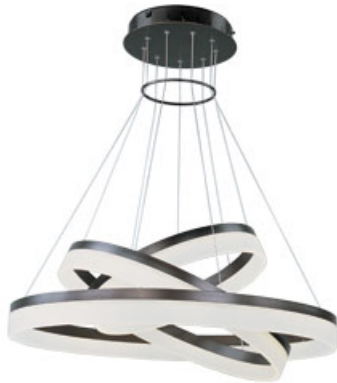
E22456-11BZ Saturn 3-Tier LED Pendant