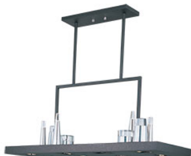
E22585-77BK Pandora 16-Light LED Pendant