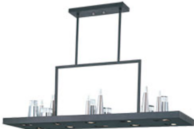
E22587-77BK Pandora 22-Light LED Pendant