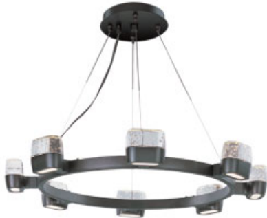
E22898-89BZ Volt 16-Light LED Pendant