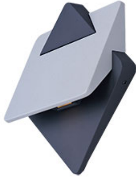
E41411-BZPL Alumilux DC 3-Light LED Wall Sconce