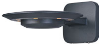
E41420-BZ Alumilux DC 6-Light LED Wall Sconce