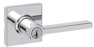
Casey Lever with SmartKey Security square rose in Polished Chrome