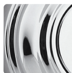
Polished Chrome 26