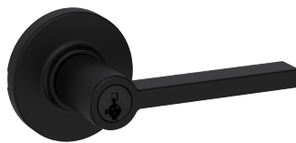
Casey Lever with Smartkey Security round rose in Matte Black