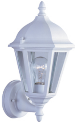
1002WT Westlake Cast 1-Light Outdoor Wall Lantern