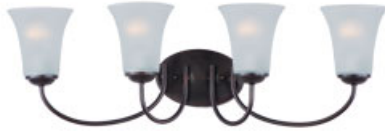
10054FTOI Logan 4-Light Bath Vanity