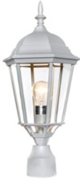
1005WT Westlake Cast 1-Light Outdoor Pole/Post Lantern