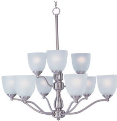
10066FTSN Stefan 9-Light Chandelier