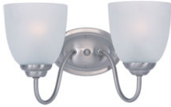
10072FTSN Stefan 2-Light Bath Vanity