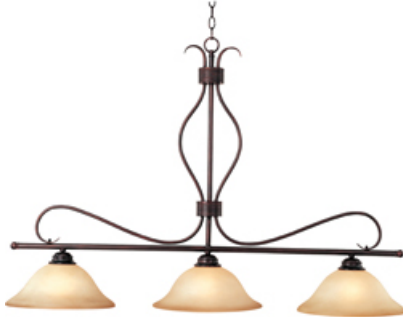
10127WSOI Basix 3-Light Pendant