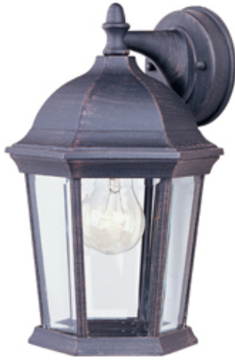
1024RP Builder Cast 1-Light Outdoor Wall Lantern