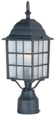
1052RP North Church 1-Light Outdoor Pole/Post Lantern