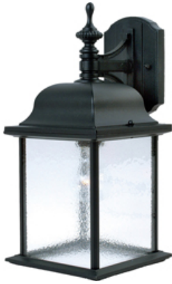
1056BK Senator 1-Light Outdoor Wall Lantern